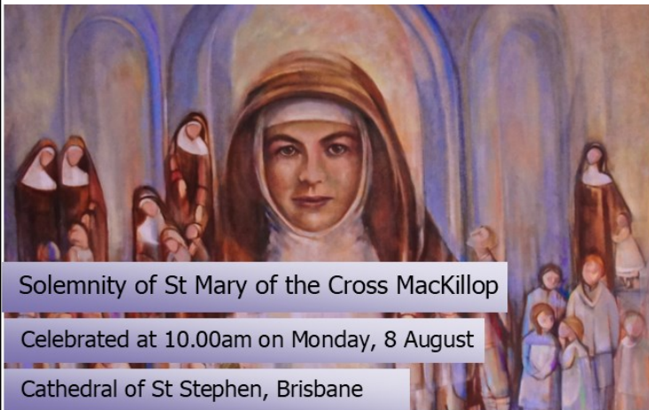
Solemnity of St Mary of the Cross MacKillop