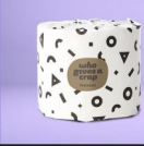
Premium toilet paper

au.whogivesacrap.org/ and investigate for yourself.