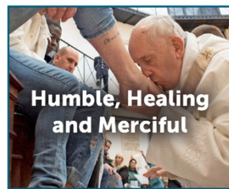
Humble, Healing and Merciful

1. Jesus came to look after the marginalized. We should show the same respect to other cultures, single or remarried divorcees, lgbt persons and married former priests.