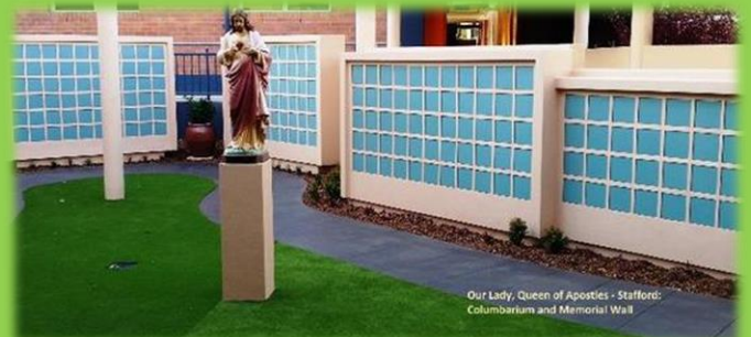
Our Lady, Queen of Apostles - Stafford: Columbarium and Memorial Wall

(Plus the price of a PLAQUE when required)